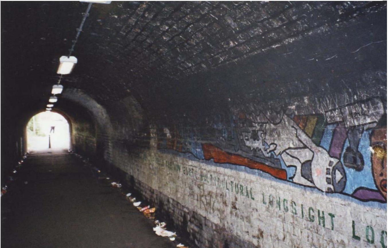
Tunnel connecting Parry Road with Stockport Road