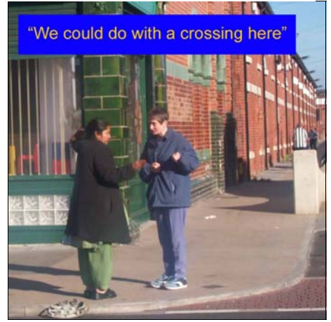
"We could do with a crossing here"