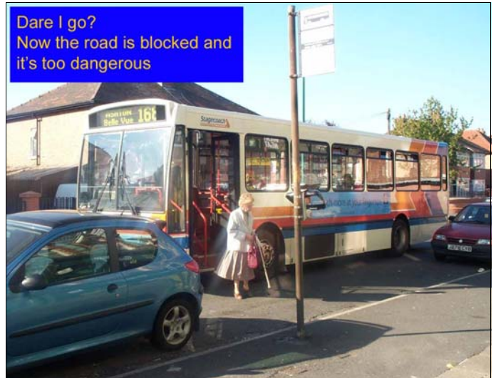
Dare I go? Now the road is blocked and it's too dangerous