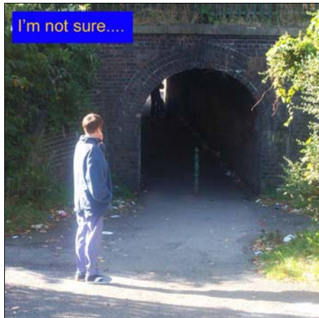
I'm not sure....