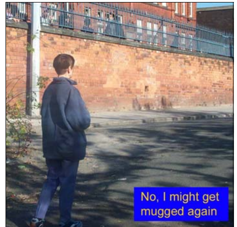
No, I might get mugged again