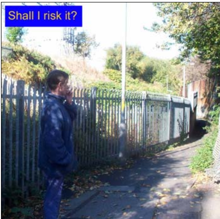
Shall I risk it?