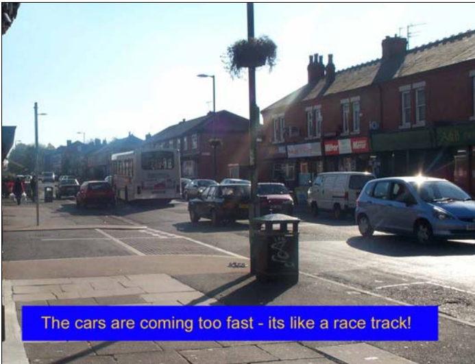
The cars are coming too fast - its like a race track!